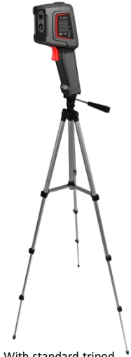
With standard tripod interface, can be equipped with customer's own tripod.

GUIDE T120H Fever Screening Thermal Camera is a fast temperature detection tool, which can be used to detect human temperature from a safety distance with accuracy of ±0.5°C. It is an economical and practical thermal camera that could meet the needs of primary temperature screening well. GUIDE T120H is not only suitable for flexible temperature screening, but also can be deployed at the entrances and exits of the public area, which makes it an ideal device to improve the efficiency of epidemic prevention and protect public health.